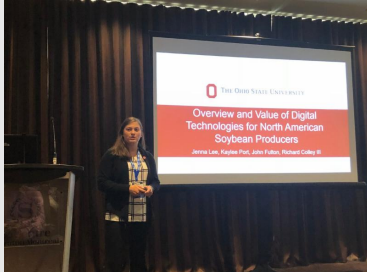
Overview and Value of Digital Technologies for North American Soybean Producers