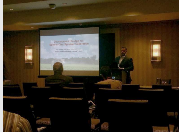
Dry Fertilizer Distribution Uniformity of Two Sources when Applying with VRT Spinner-disc Spreader