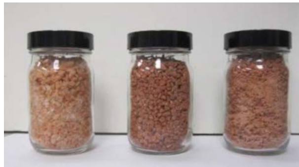
Figure 2. Samples of Muriate of Potash (0-0-60) collected from a spreader prior to application. While each sample has the same chemical formulation, note the inconsistency in physical quality. These samples are from two different potash sources. The middle and right samples are from the same source with the right sample containing a range in particle size including dust. The right sample can be difficult to spread uniformly versus the other two samples. A setup change could be required between the left and middle samples to maintain proper metering and distribution.

Particle size is a measure of the average granule size normally reported by a single but nominal diameter measurement for an entire fertilizer load or sample. Since particle size varies within fertilizer, particle size distribution indicating the variability in size is normally reported for fertilizers. Particle size and size distribution both have a direct influence on spread width and uniformity. Therefore, two important points need to be understood about particle size in relation to spreading fertilizers. Particle size has an exponential impact on spread width and to the risk of product segregation. In general, larger particles are thrown further by a spreader than smaller particles. Therefore, a wider spread width can be used for larger particles. For an example, a study reported that urea with a particle diameter of 4.7mm can have a spread width of 65 ft whereas urea with a particle measurement of 1.7mm has a spread width of only 33 ft. Secondly, the more variation in particle size within a fertilizer load, the greater the risk of uneven distribution and/or segregation. This is especially true in the case of fertilizer blends. Fertilizer with a wide range of particle sizes, including very small particles, will be difficult to evenly spread with small particles (e.g. dust and fines) landing behind the spreader (assuming no wind). If a blended fertilizer is used, the particle diameters of different products should be within 10% of each other in order to